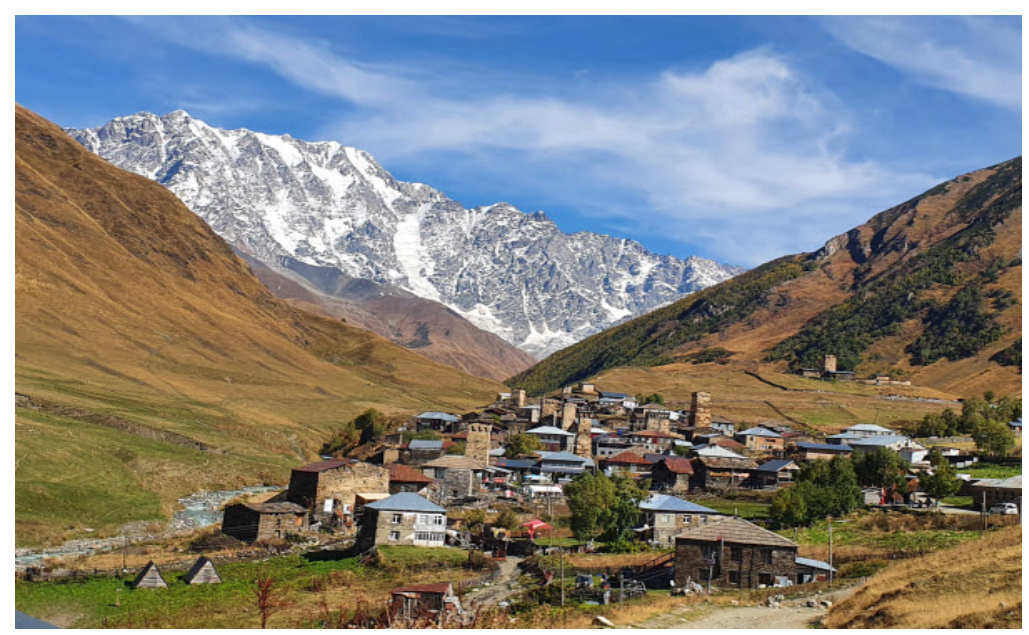
UNESCO list Ushguli Village in Mestia

Day 18 Home. Lands KUL at 825AM TUE 18 APR 2023.