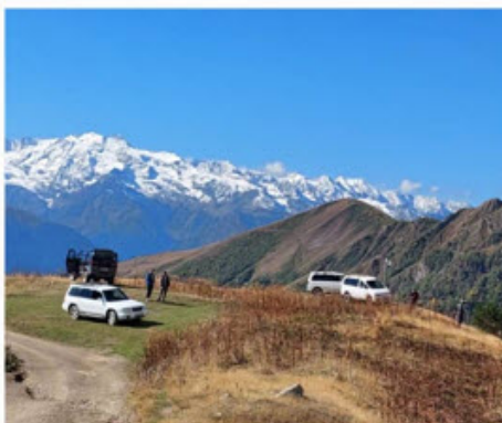
Lake karoldi - hight alpine vegetation

Trip involve several walks and treks. We hire a Mercedes Sprinter with a Georgian guide and a local driver for the duration of this trip. We stay budget hotels and local guesthouses. We use smaller chartered 4WD vehicles for some mountain areas. Large sized 28 inches luggage ARE NOT ALLOWED on Yongo trips. Many Yongers manage with 22 inches but most will use 24 inches trolleys.